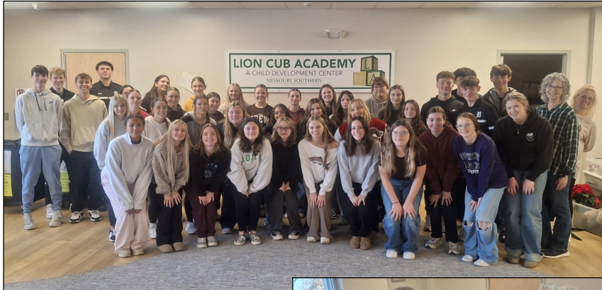
ABOVE: Morning student associates pose with staff from the Lion Cub Academy at Missouri Southern after spending the morning help clean the kitchen and indoor play areas of the facility.

As a finale to the MOSO CAPS fall semester, student associates participate in a one-day “acts of service” project aimed at giving back to the Missouri Southern campus or an organization in the local community. This year students spent time at the Lion Cub Academy at Missouri Southern, helping clean their kitchen, indoor play area, multiple hallways and equipment spaces, and both outdoor playgrounds,