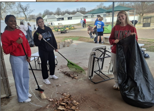
LEFT: The west outdoor area may not have many trees, but you would not have guessed it from the bags of leaves the students managed to collect! Pictured are students early in the sweeping and bagging process.