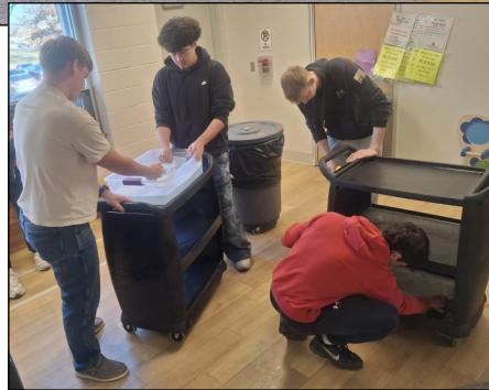
RIGHT: Among the tasks completed by morning students were cleaning, sterilizing, and labeling the carts used by LCA teachers and staff to transport food and beverages to classrooms throughout the day.