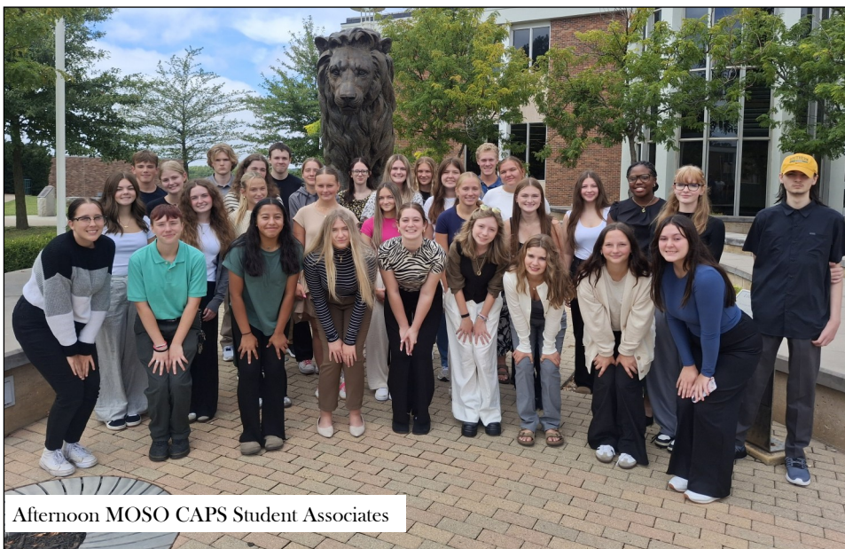
Afternoon MOSO CAPS Student Associates

Introducing the 2025-26 Cohort of MOSO CAPS Student Associates (Eighty-three and Growing!)