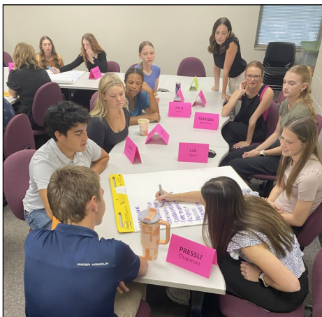
ABOVE: A group of morning students work on their client project during the project management session led by OWN Engineering.