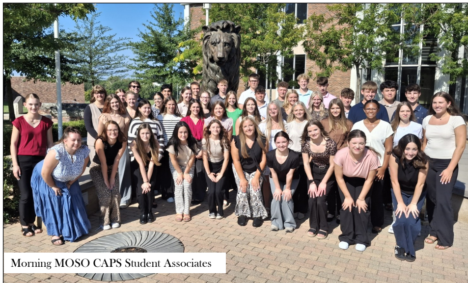
Morning MOSO CAPS Student Associates

Introducing the 2025-26 Cohort of MOSO CAPS Student Associates (Eighty-three and Growing!)