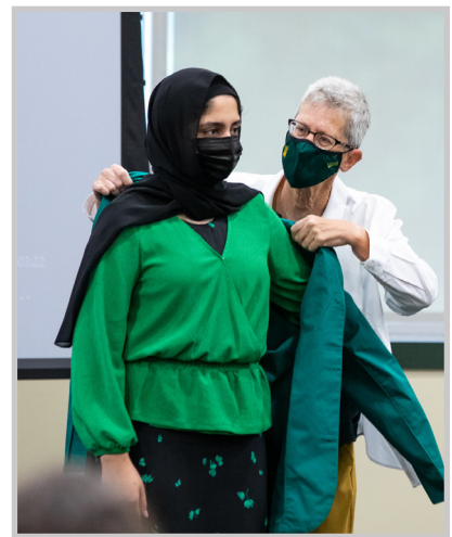
Green Coat Ceremony