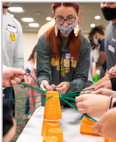
Global Leaders Welcome