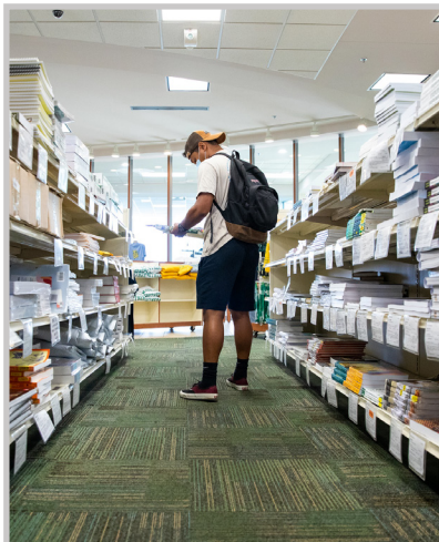
First Day of the Semester