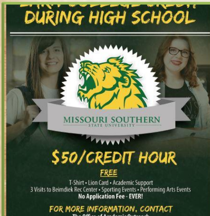
General Program Flyer