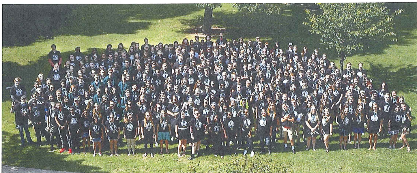
MSSU First Year Student Convocation - Incoming Class Fall 2017

8:30pm - 10:30pm Survivor Night & Zombie Trail