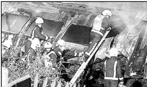
Firefighters attend to the smouldering wreck of one of the trains.

By ANTHONY LONGDEN Uxbridge Gazette Series, England