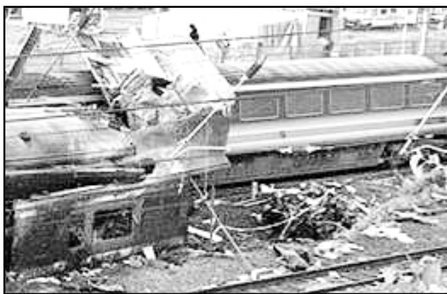
The crash was caused by a train passing through a red signal.

Reading is a big commuter town about 40 miles from